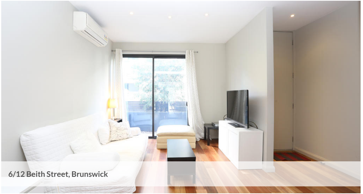
6/12 Beith Street, Brunswick